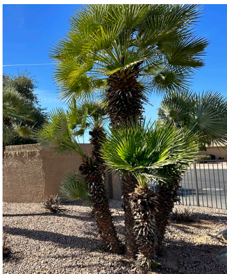
Mediterranean Fan Palm