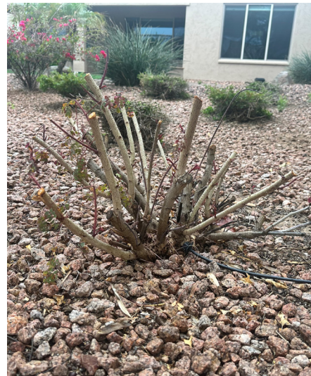
Red Bird of Paradise (shrub)