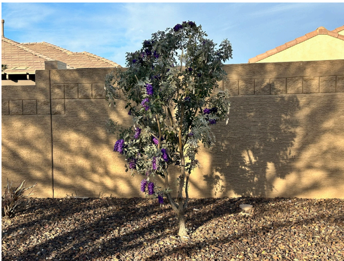
Texas Mountain Laurel