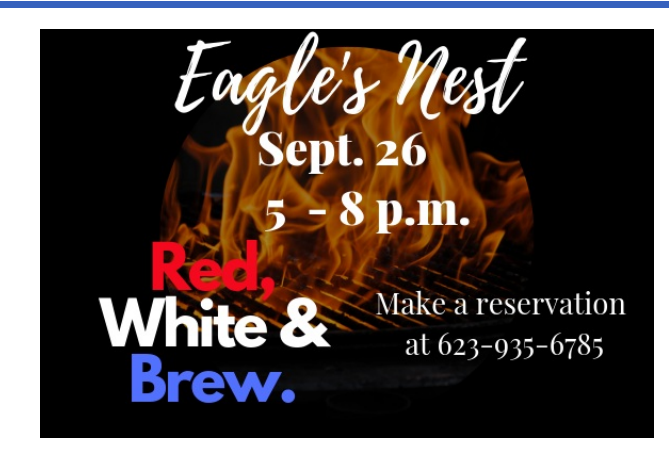
Sept. 26 - Red, White & Brew - click here for menu

Eagle's Nest Bar/Lounge - will be closed Sept. 23-29; however, a temporary bar will be setup in the Dining Room area. <u>Click here to read more</u>